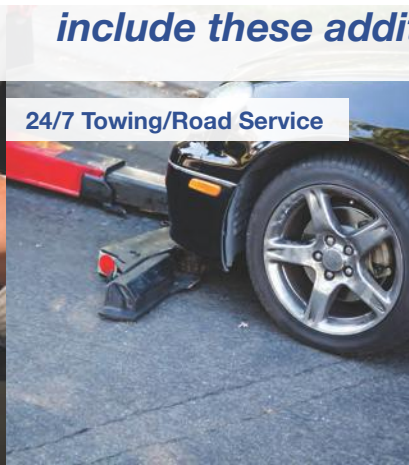
24/7 Towing/Road Service